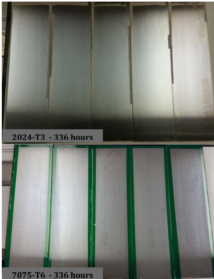
Figure 1. Salt spray corrosion performance of 2024-T3 and 7075-T6 aluminum coated with CHEMEON TCP-HF SP.

Coating weight: Coating weight analysis was done on CHEMEON TCP-HF SP processed 2024-T3 and 7075-T6 aluminum alloys in accordance with MIL-DTL-81706.